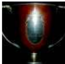
1914 Original 1st place trophy