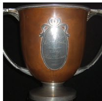
1914 Original 1st place trophy