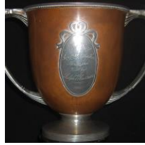
1914 Original 1st place trophy